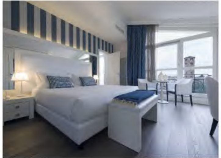
Bezzi Palace - Suite

Nowadays Impresa Orioli is the parent company of all Orioli's societies, leading owners and developers of Romagna.