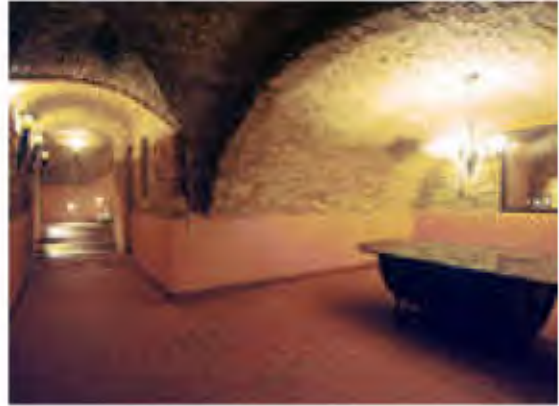
The Villa' cellars

Moreover, the company is locally famous for the restore of “VILLA PANDOLFA” in Fiumana, near Predappio. It is an ancient, famous villa that was equipped with cellars for wine production.