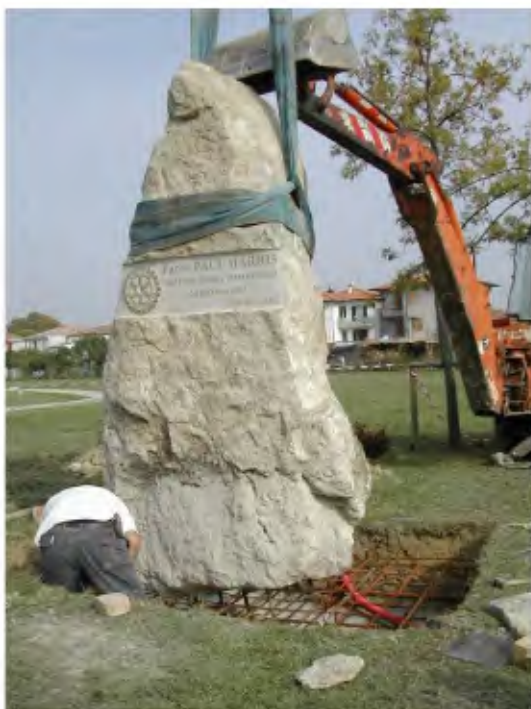
Paul Harris Park: monolith

Thanks to the expertise acquired over the years, the company has now set a future business plan, which includes the focus on civil building in reinforced concrete, which was and still is one of the strong points of the company's activities.