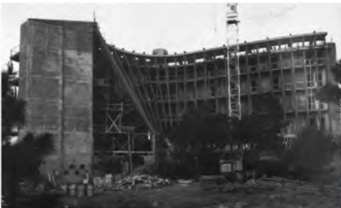
Hotel Bellevue 1959

Among the other most important facilities built by the company it is to be mentioned Hotel Bellevue in one of the most popular locations for tourism, Milano Marittima.