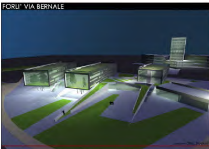
Business Park - Forli

Nowadays Impresa Orioli is the parent company of all Orioli's societies, leading owners and developers of Romagna.