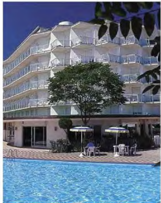
Hotel Bellevue today

Hotel della Citta', the local belltower, Hotel Michelangelo, and the headquarters of the Chamber of Commerce are nowadays Forli's flagship, an integral part of the city heritage.