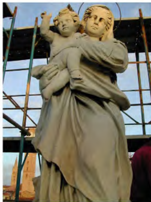
Lady of the fire

Thanks to the expertise acquired over the years, the company has now set a future business plan, which includes the focus on civil building in reinforced concrete, which was and still is one of the strong points of the company's activities.