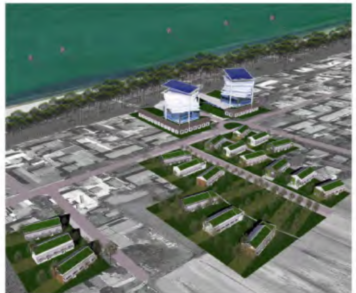
Nuovo parco urbano di Cervia